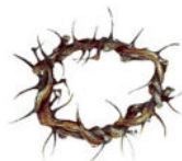
THE CROWN OF THORNS